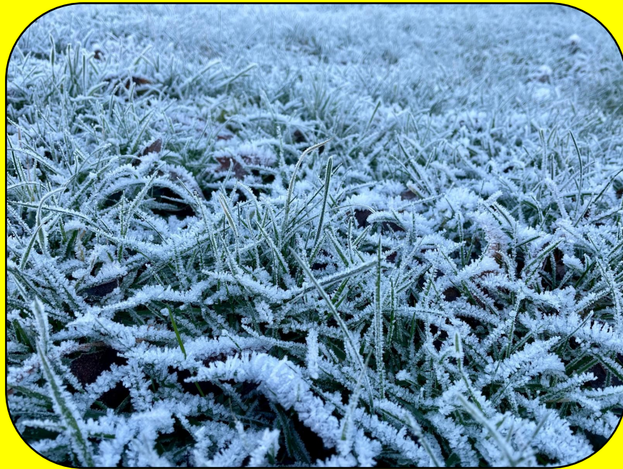
Frost on grass in the recent cold spell.