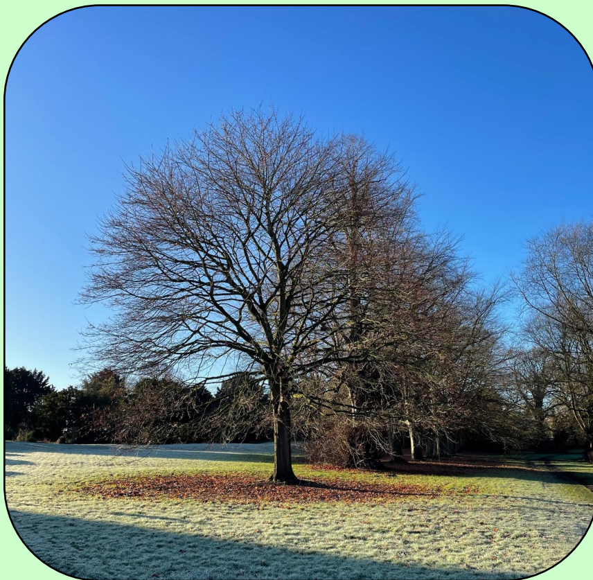
Recognise where this was taken?

The Diocese now has all the information and pictures with which to produce an advert for the vacancy in the Benefice. We hope to receive the draft copy within the next few weeks so possibly the advert can go out shortly afterwards. As we have found so far, there are frequently hiccups along the way so don't be surprised at further delays!!